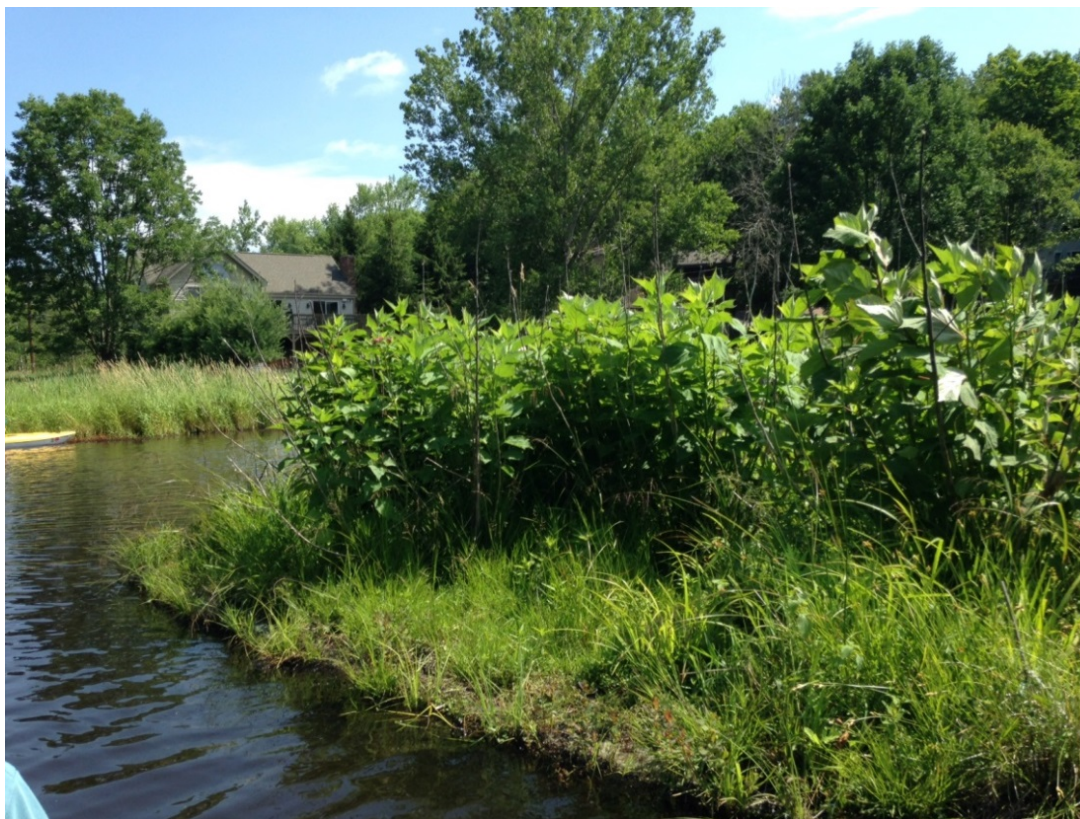
Figure 2: Established Floating Wetland Island in a lake in Wayne County, PA in 2014