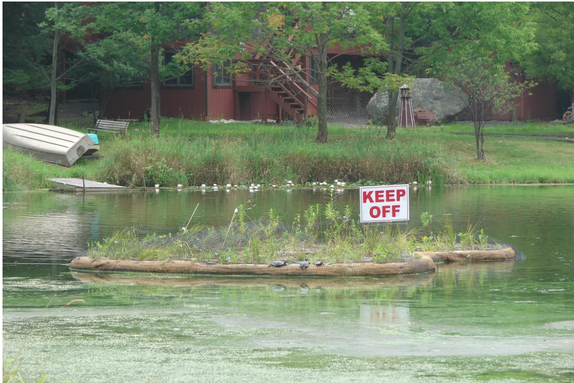
Figure 1: Floating Wetland Island built, deployed and anchored in a lake in Wayne County, PA in 2010